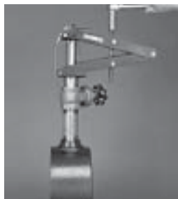
Model HTT - Hot Tap Tool