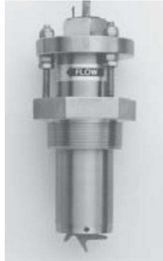
Model 220BR (Brass) & 220SS (Stainless Steel) Sensor