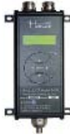
Model HY-ALERTA™ 1600

Hydrogen leaking into the area surrounding the hydrogen generator could make the containment room potentially explosive. HY-ALERTA™ 1600 installed in generator rooms will ensure safe operation of generators. Programmable alarms, relays and system integration are available options.