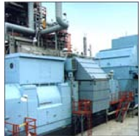
Figure 2: Typical generator cooled with Hydrogen