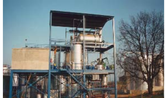
Figure 1: Partial hydrogenation unit

The disposal of excess hydrogen from the oil hydrogenation process is key to ensure safety of a process plant. The excess Hydrogen in combination with other trace gases is burnt through using an oxidizer. Hydrogen must be monitored within the exit stream to avoid surges or pulses in the burning process, which could cause fires or explosions. The end user's goal is to keep an on-going steady burn, thus keeping the hydrogen within a specific range. In addition, the process hydrogen needs to be monitored to ensure that the hydrogenation process is efficient prior to the oxidizer.