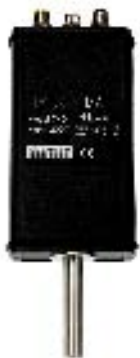
Model HY-OPTIMA™ 740

H2scan analyzers provide real-time, inline measurements in process streams. The measurement is also simplified to meet the needs of this application as the technology can operate with or without oxygen present and without the requirement of a reference or sample gas.