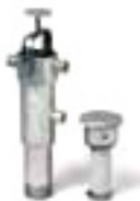
Sure-Lock™ Filter Assembly

The Baldwin™-Series direct extractive filter probes feature an advanced design to extract sample gas and remove particulate while preventing condensation prior to the gas sample entering the heated sample line.